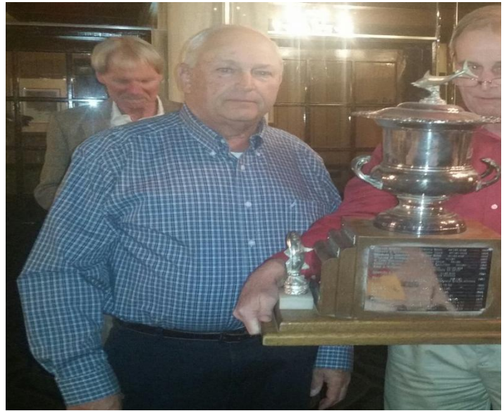
Buster Best Fish of the Year Trophy